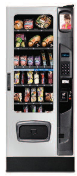
Shown with silver ADA doorand kick panel options.