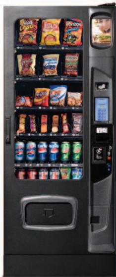
Shown in black with ADA door, iCart touch screen, automatic delivery assist and kick panel options.