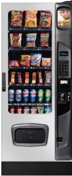
Shown with silver ADA door and optional kick panel options.